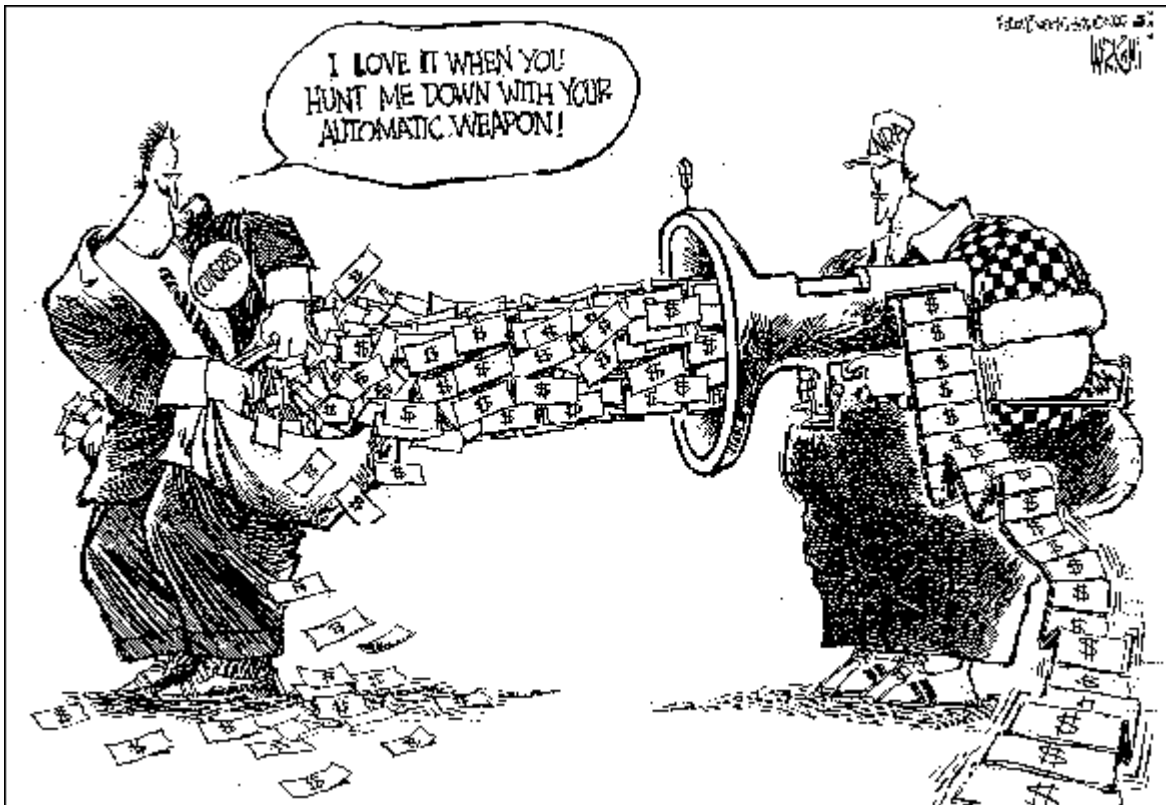
SEATTLE POST-INTELLIGENCER, SEATTLE, WA JUNE 16, 1999